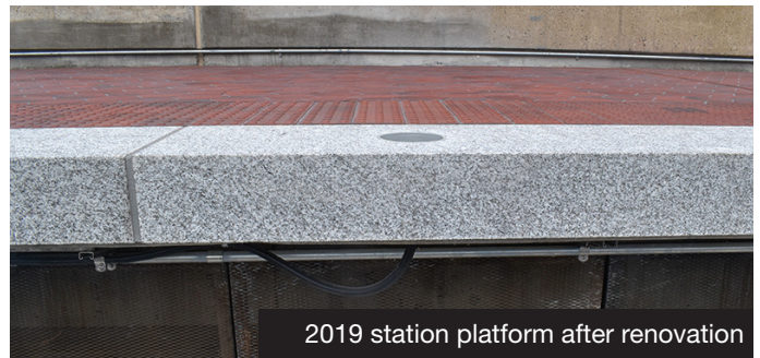
2019 station platform after renovation