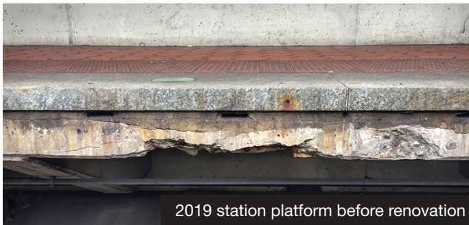
2019 station platform before renovation