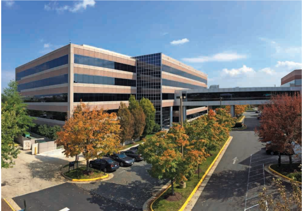
Telework Award Northwest Federal Credit Union Herndon, VA