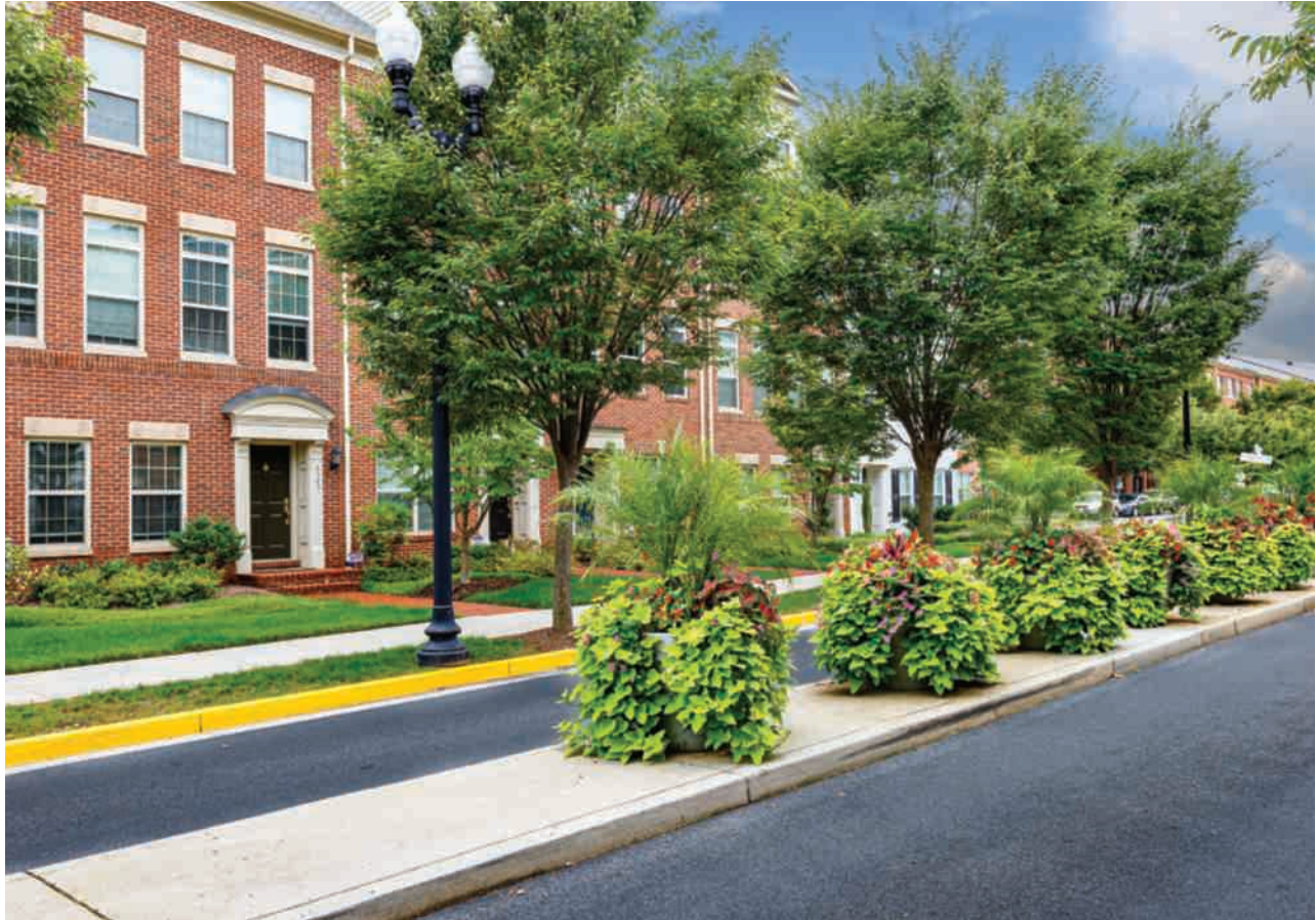
Incentives Award Environmental Enhancements Sterling, VA